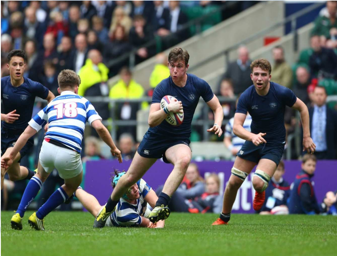
BWS 1 st XV at the NatWest Schools' Cup Final at Twickenham - 29 March 2017

A broad extra-curricular programme helps students to understand more of the world, to challenge themselves and to grow as individuals. At Bishop's we aim to provide many and varied opportunities, so that every student has the chance to find new interests and achieve great things. Competitive sport is in the lifeblood of the school. Rugby, Cross Country, Athletics, Basketball, Soccer, Hockey and more figure in the sporting calendar, with regular fixtures against schools across Wiltshire and the South West of England. While we are justly proud of our outstanding reputation for sporting success both regionally and nationally, we value equally the commitment of students who give their best to an activity they enjoy.