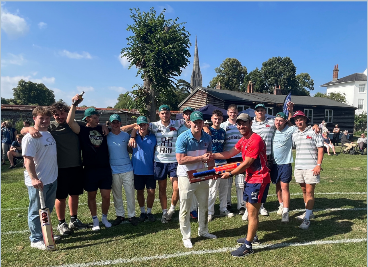
The Day2ers - winning team